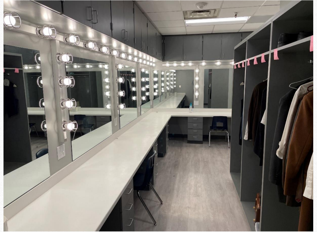
HALTOM HIGH DRESSING ROOMS