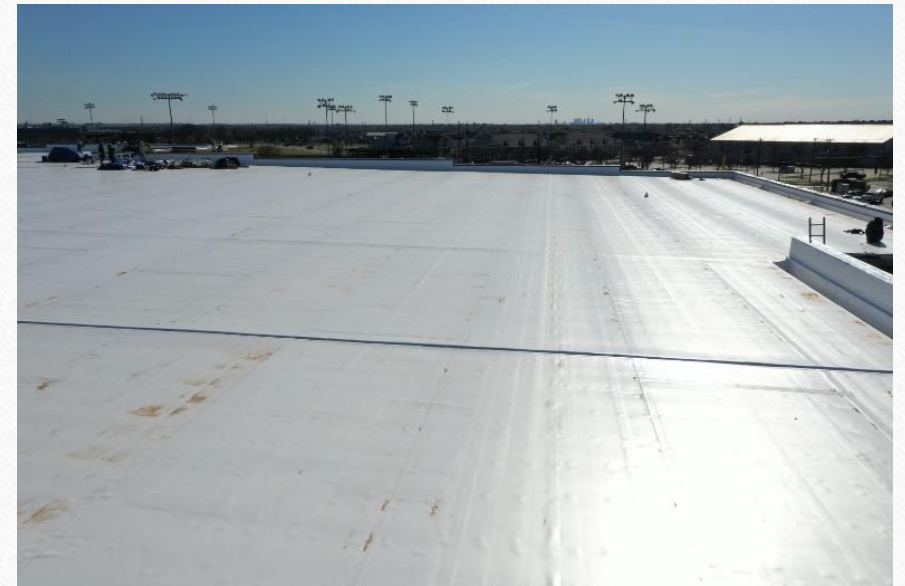
Birdville High School Roofing