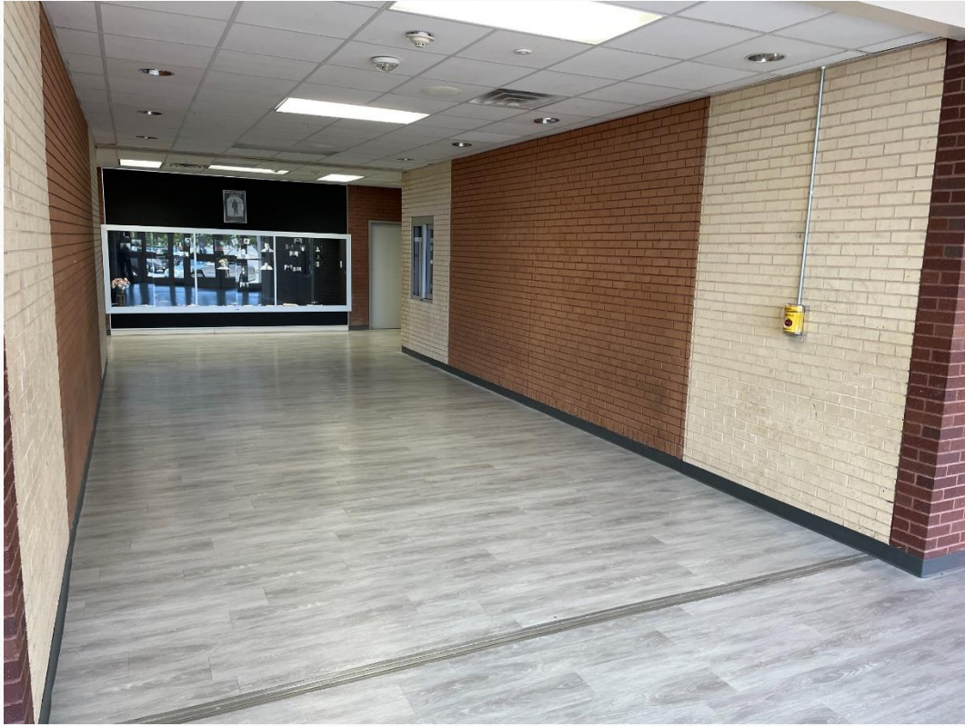
HALTOM HIGH LOBBY