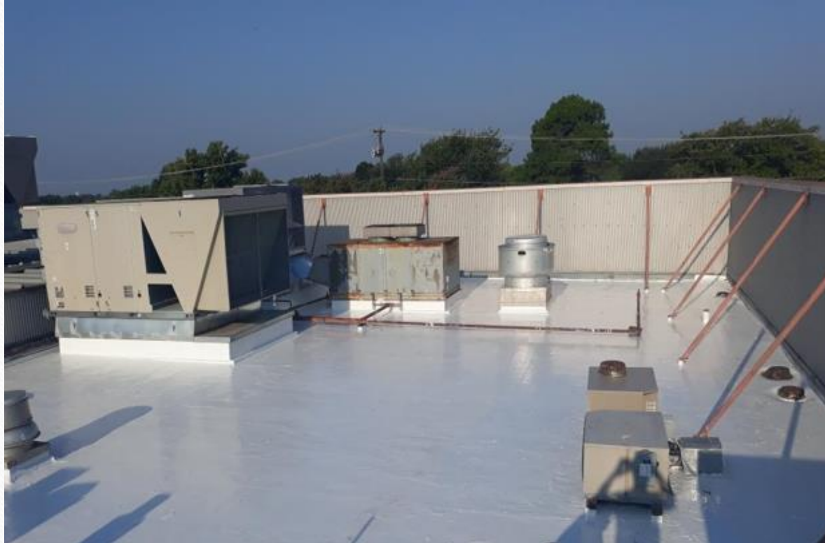
North Ridge Middle School Kitchen Roofing