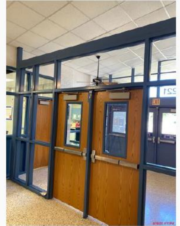
Security Vestibules at Multiple Schools